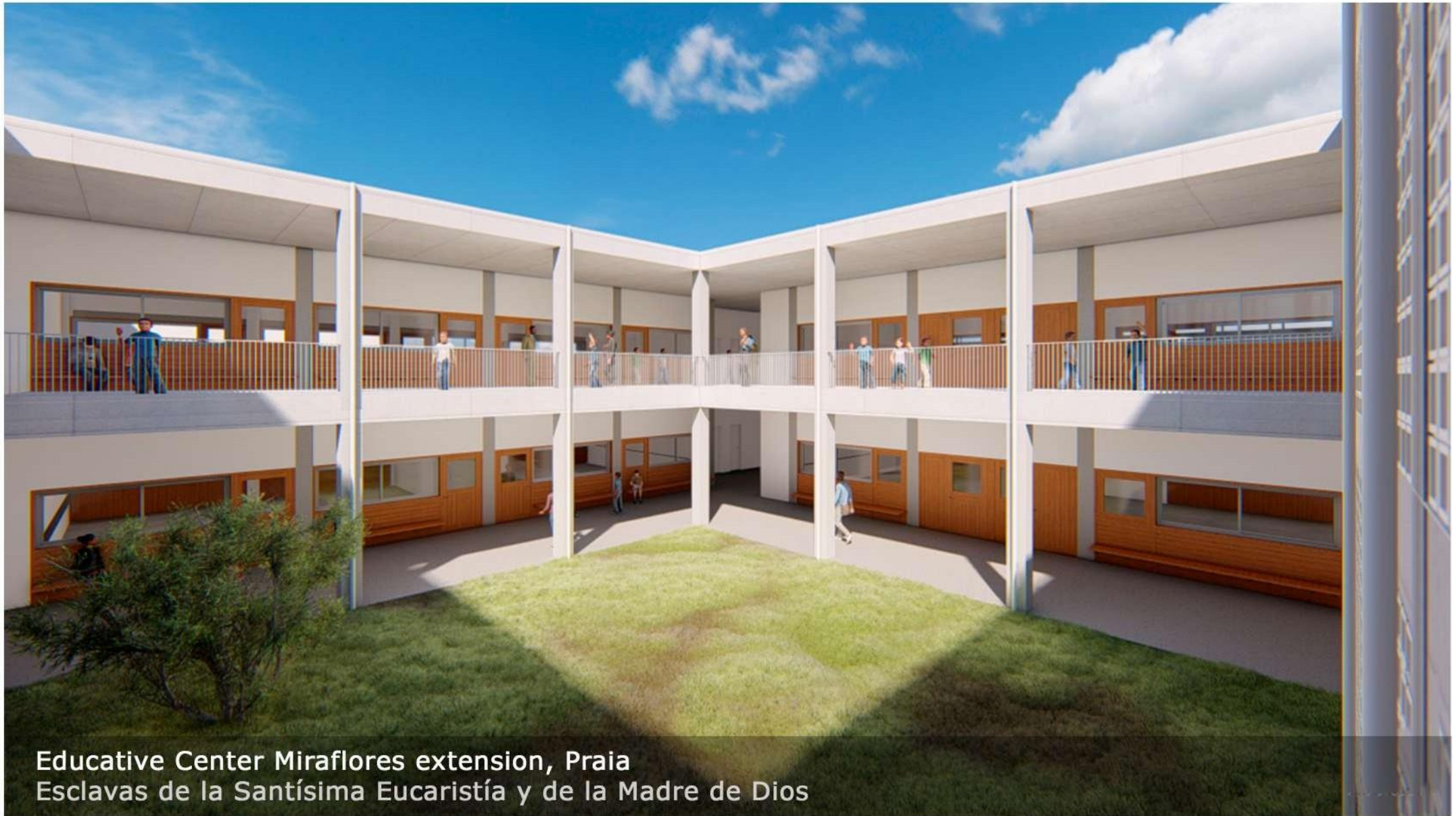
Educative Center Miraflores extension, Praia Esclavas de la Santísima Eucaristía y de la Madre de Dios